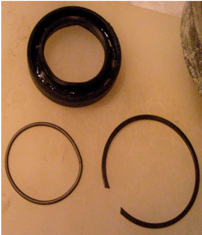
Seal, Niro ring and spacer