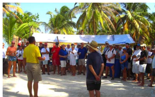
Skippers' Briefing on the beach in the San Blas islands

The time and location of the briefings will be published in the rally programmes.