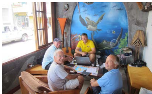
World ARC office in Puerto Ayora, Galapagos

Details of the location and opening hours of the rally offices in each port are covered in the skippers' briefing.