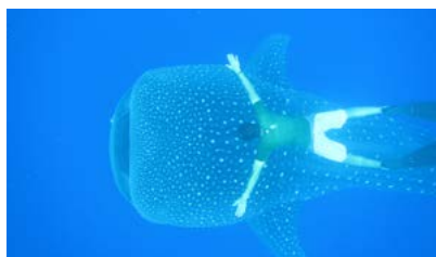
Swimming with whale sharks in St. Helena - sent in by American Spirit II

The facility is administered by the World ARC team and all it requires crews to do is to send email logs and attach photographs to a unique email address. Further details will be given prior to the start of your rally, when the next World ARC web pages go live for you to share your adventures too.